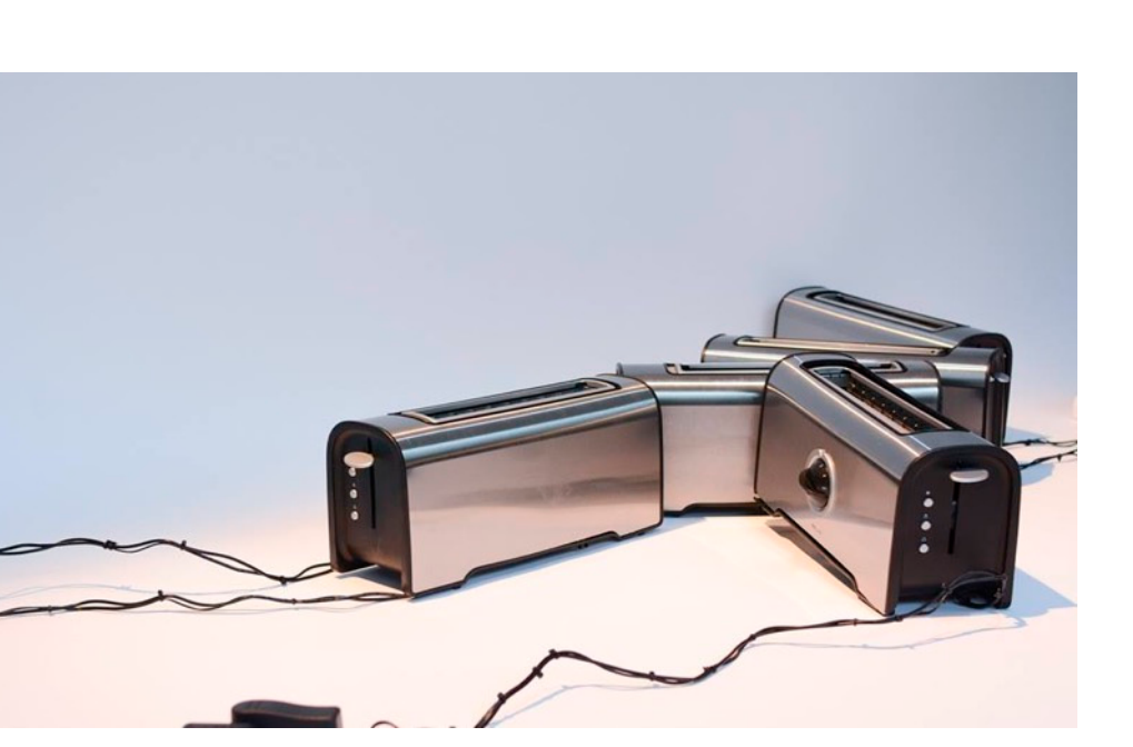
Figure 8. Toasters, Installation by Olivain Porry at Cité des Arts, Paris, 2018.

As both the Assemblée des Objets and Toasters show, COCO^2 installations are generally flexible, with a variable geometry that constitutes an additional layer of complexity. It is impossible to predict what is going to happen and how these installations will evolve through time. It may happen that spectators assist in something unique, never seen by the artist who designed the COCO^2 . The final installation is the result of a series of events over which the artist does not have absolute control.