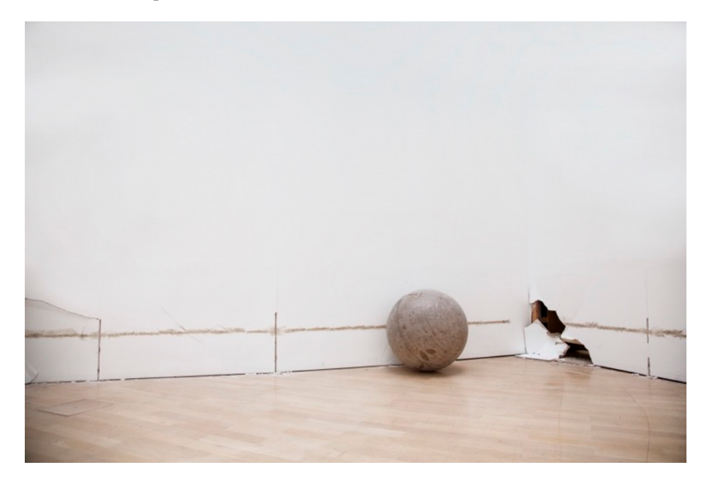
Figure 2. 360° Presence, Jeppe Hein, Kunstmuseum Wolfsburg, 2015.

Another major artistic reference that influenced our work, is the project 360° Presence by Jeppe Hein (2002). In the installation space, a 70 cm diameter metal sphere moves across a room without any predefined trajectory (Figure 2). As visitors enter the room, the sphere starts moving around, whilst violently bouncing against the wooden walls; as time passes, the walls become increasingly damaged. While the sphere moves around, as if living its own life, the viewer assists without having a say or without the choice to stop or to influence the sphere's actions.