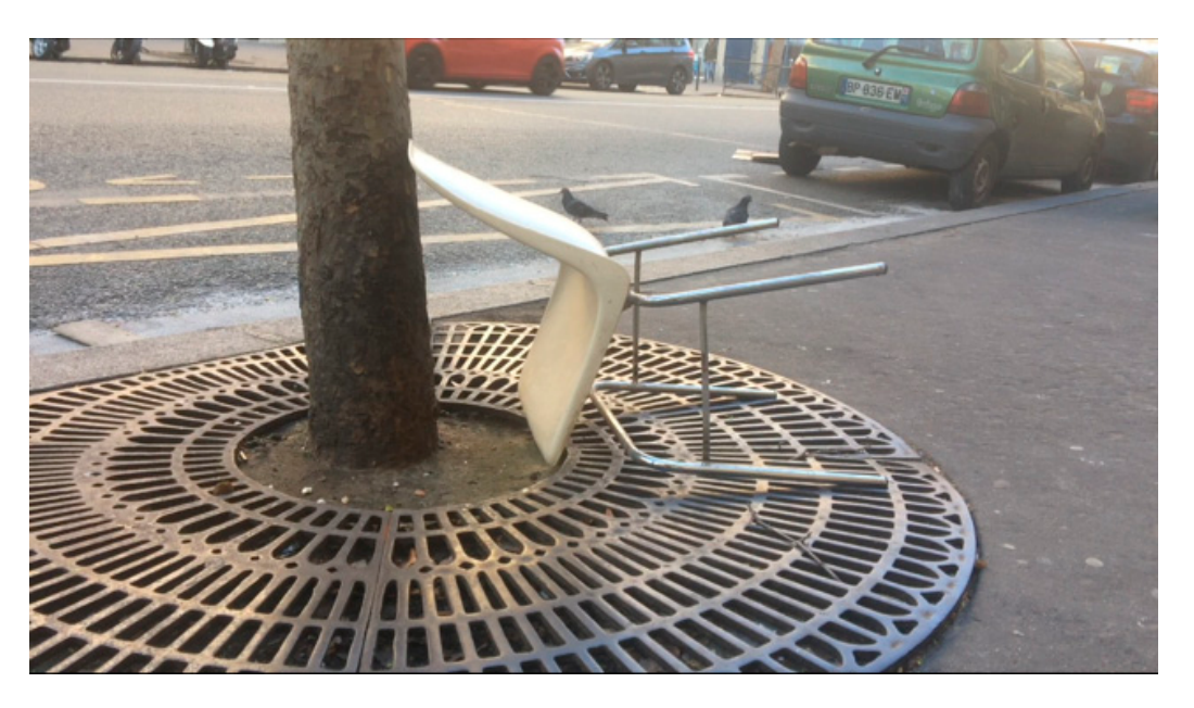
Figure 1. Abandoned chair seen on Boulevard Voltaire, 11ème arrondissement in Paris, 2017.

The Group of Revolutionary Objects was born in 2017, against a backdrop of excessive overconsumption and the widespread abandonment in which private companies such as Ikea, create a vast impact in public spaces within cities around the world. By that time the US, the second largest carbon emitter in the world<sup>2</sup>, was preparing to leave the Paris Agreement, which had established the commitment of 196 countries in reducing carbon emissions and tackling the climate crises. The US's decision to opt out of the agreement would have been hard to deny as anything other than an immoral act, where greed and economic growth were prioritised over a reduction of carbon emissions. The impact of the US carbon footprint on the world was too big to be dismissed. This event, combined with the hyper-consumerist lifestyle and the rise of abandoned objects on the streets of Paris, were certainly powerful triggers at the outset of this project.