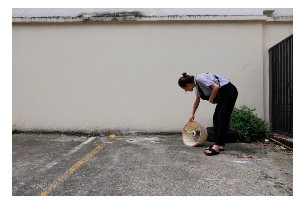
Figure 5. L'Assemblée des Objets Parisiens, GOR, film shooting scene in the Quartier Latin, Paris, 2018.

When our protesting objects returned to Paris, they were visibly "tired", some clearly broken, with missing parts; a few others showed some light damage, scratches, and dents, with dead motors and bloated batteries. These were the signs of a brave protest in a chaotic environment unregulated by humans. Once the objects were given some care and repair, we decided to return the objects to where they once belonged—the streets of Paris. The objects were finally rioting in the streets, vibrating, clunking, and striking against the pavement and against each other. These moments were documented in a short film called l' Assemblée des Objets Parisiens , which depicts the different objects, wandering and assembling in the streets of the Quartier Latin, in the 5th arrondissement. This film would be exhibited later, together with some of the featured objects at Lieu Multiple in Poitiers (Figure 5).