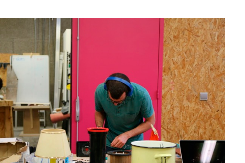
Figure 4. GOR Artist Residency at Bel Ordinaire, Pau, France, 2017.

When our protesting objects returned to Paris, they were visibly "tired", some clearly broken, with missing parts; a few others showed some light damage, scratches, and dents, with dead motors and bloated batteries. These were the signs of a brave protest in a chaotic environment unregulated by humans. Once the objects were given some care and repair, we decided to return the objects to where they once belonged—the streets of Paris. The objects were finally rioting in the streets, vibrating, clunking, and striking against the pavement and against each other. These moments were documented in a short film called l' Assemblée des Objets Parisiens , which depicts the different objects, wandering and assembling in the streets of the Quartier Latin, in the 5th arrondissement. This film would be exhibited later, together with some of the featured objects at Lieu Multiple in Poitiers (Figure 5).